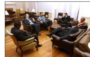
Executives from government and the private sector take a break during Strathmore's Combating Fraud Seminar in Nairobi.