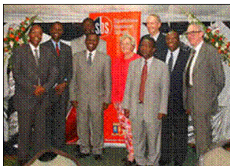
Strathmore University's senior leaders with Baroness Lynda Chalker celebrate Strathmore Business School's AMP Launch.