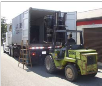
Loading up 16,686 library books. Next stop: Strathmore, Nairobi!

A total of 16,686 books, boxed and shrink-wrapped on eight palletes, are now safely sailing to