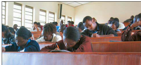
Strathmore students such as these will soon benefit from Strathmore's new membership in IFC's Global Business School Network.