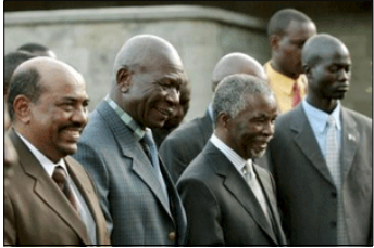
VP Awori (second from left) with other African leaders.

Awori: I have visited America many times, and I know that great American institutions have been helped by members of their alumni. Kianda and Strathmore alumni, wherever they are, I call on them: they have a responsibility not only to Strathmore and Kianda, but to Kenya. These two institutions have produced excellent leadership. Let their alumni come forward. Kenya needs them. Let them come back and see what Strathmore has grown into, what Kianda has grown into, and with their help what they together can further grow into.