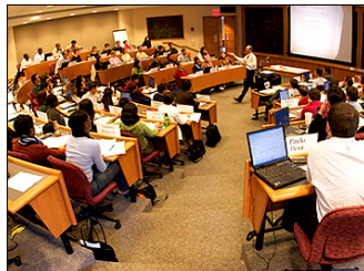
Case-method class at Harvard Business School

really good to see the case method first-hand," Njenga noted. "We plan to use the