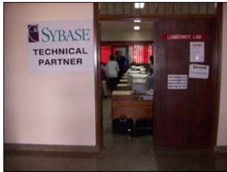
Sybase is one of the corporate partners teaming up with Strathmore University. Above, a Strathmore computer lab in which Sybase training takes place.

Corporations in Kenya are also partnering with Strathmore for the provision of scholarships and bursary support for needier students. East Afri-