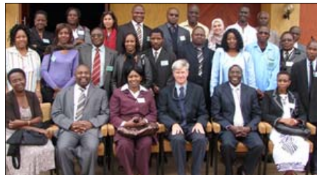
African Sustainability Conference Delegates Convene at Strathmore

Accounting course will address corporate environmental audits, law, policy and ethics and international standardization.