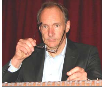
Internet Pioneer Tim Berners-Lee

mation. The essence of the Web was to standardize the