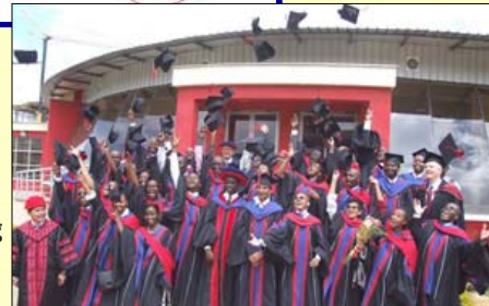
Strathmore's first MBA graduates

business school building, a modern teaching and learning center and a modern student