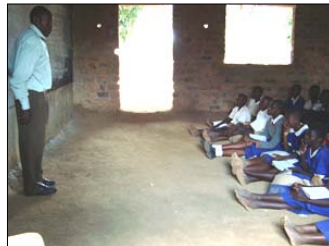
Past: Sitting on the floor at Uref Primary School

Students from Strathmore's Community Outreach Program (COP) traveled to Uref Primary School in rural Nyanza Province in August for a three-day work camp. Their objective: construct desks for the school, where students currently sit on dirt floors.